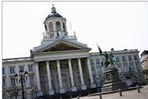
Meeting point: St. Jacques de Coudenberg

Please note that this event is limited to 25 participants.