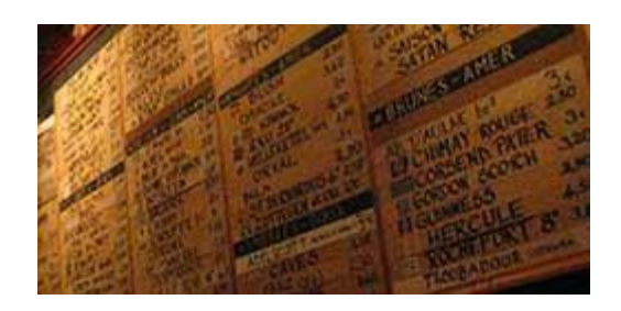
L'Atelier Rue Elise 77 1050 Brussels (Ixelles)

Join other beer and Brussels lovers on Valentine's Day as we embark on another Second Tuesday Historic Bar Tour social hour. This month we leave the central city and travel to the Ixelles neighborhood for an unusual bar, which is one of the first bars in Brussels. The L'Atelier bar features a wall board with a great variety of beers to choose from within every category. The entrance is very unassuming so don't be fooled... it's a treat for all beer lovers. L'Atelier features a "warm atmosphere with candles, large beers' choice, located at a stone's throw from the university, this bar is still appreciated by" all generations. L'Atelier accepts cash only (ATMs nearby).