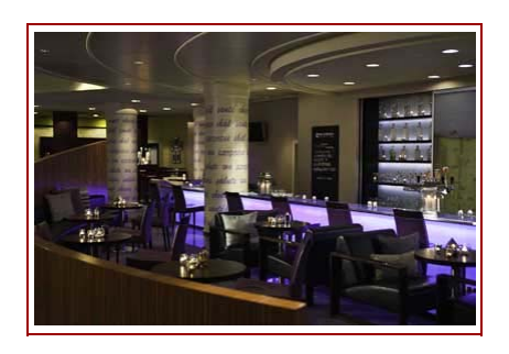
Renaissance Brussels Hotel (ground floor near the bar) Rue du Parnasse 19 1050 Brussels (Ixelles)

(walking distance from Place du Luxembourg)